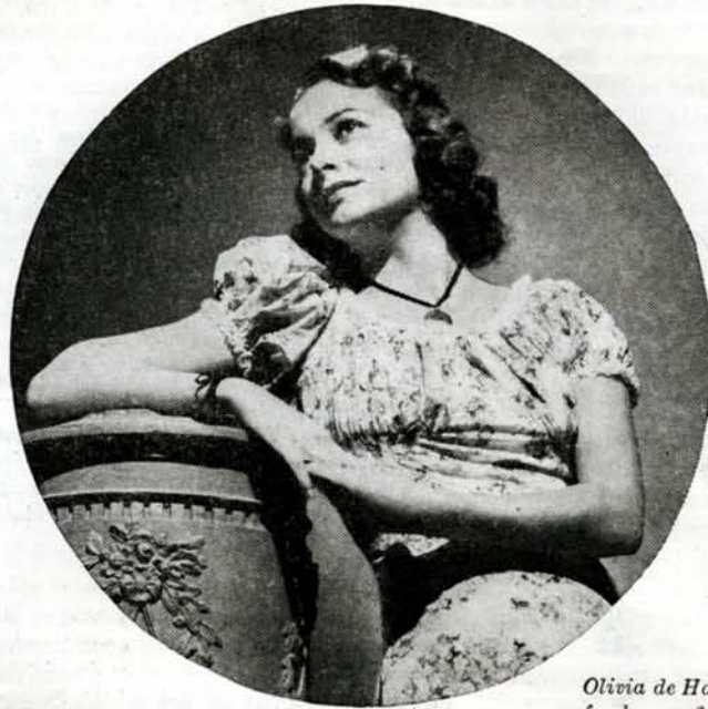
Olivia de Havilland looks fresh as a daisy in spite of heat and studio lights